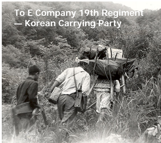
To E Company 19th Regiment — Korean Carrying Party