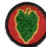
24th Infantry "Victory" Division