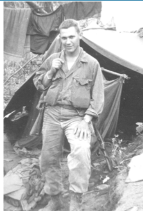
Kansas Line, Korea June 1951