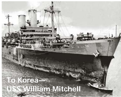
To Korea — USS William Mitchell