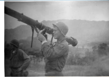
3.5 Rocket Launcher