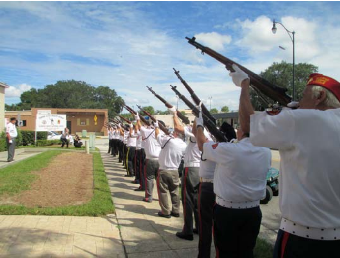
Rifle Unit firing (cartridge faintly visible in front top right below the arm supporting the street light.) WS