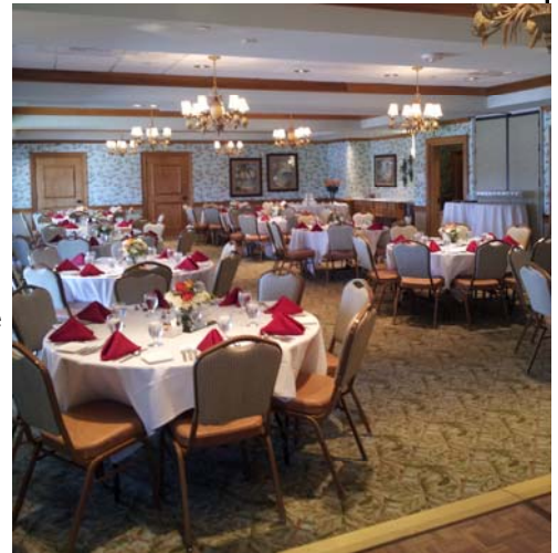
Above: Great Room where Convention will be held and meals served.

Some of you have wondered how you can get involved with the Chapter; this is certainly one you can start with.