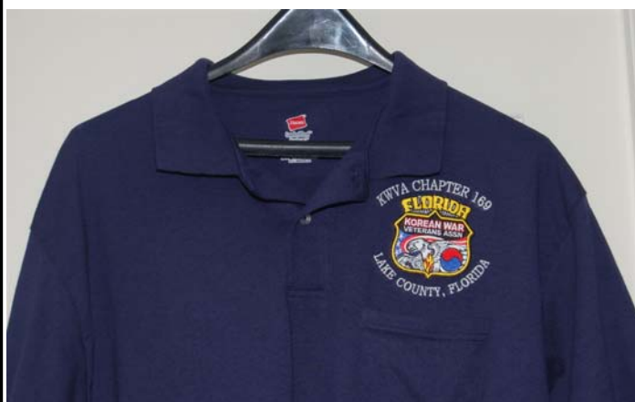
Photo above shows the shirt. As you can see, it is a very nice shirt and well worth the cost.

You can order one of these from Dwight Brown (352) 205-8536 or (352) 638-0514 cell or kaydees@embarqmail.com. Dwight will order these with our logo reading Lake County.