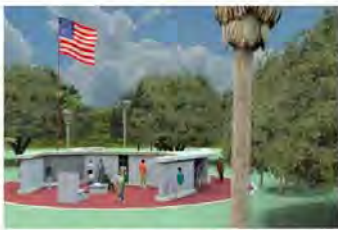
July 27, 2012

Veterans Memorial at Fountain Park, Leesburg, FL