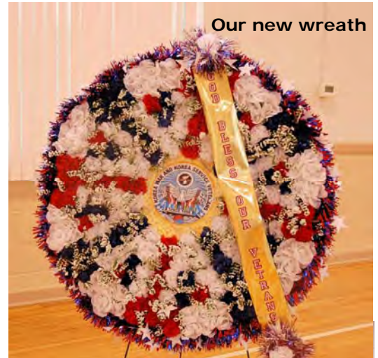
Our new wreath