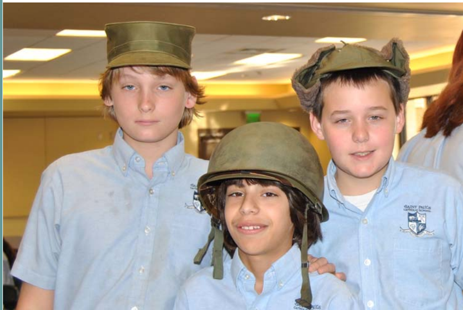
Three young men at Tell America at St. Paul's looking really sharp in