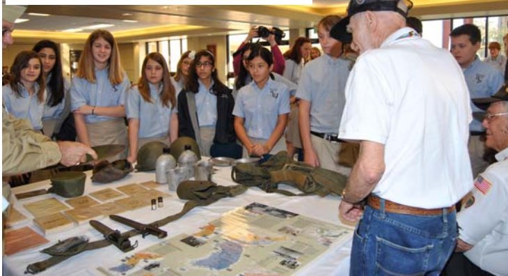
Dwight's exhibit materials fascinated students.

has become a major Chapter 169 program. It is through Tell America that we dispense most of our scholarship and charitable contributions.