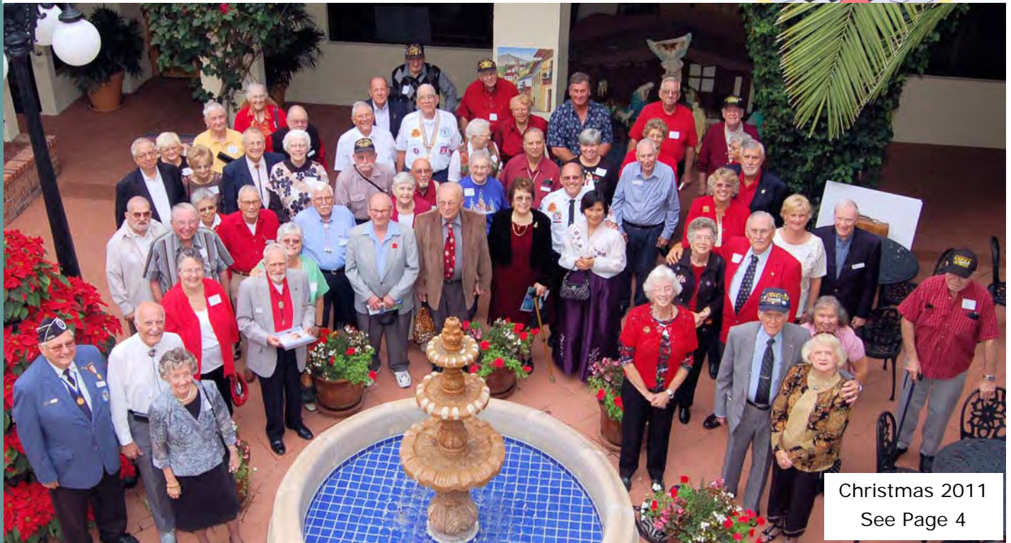
Christmas 2011 See Page 4