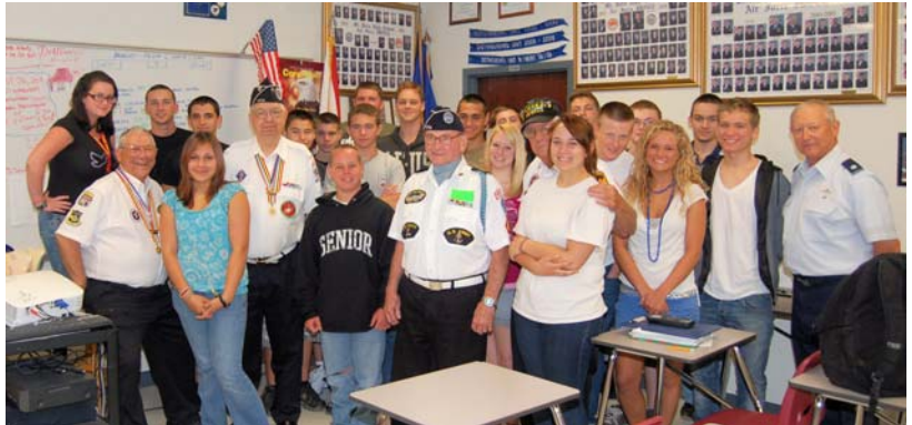
Tell America at Mount Dora AF Jr. ROTC April 25, 2011