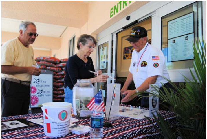
Telling America at Publix in Mount

This is your Chapter. It needs you to meet its objectives. Some of these monies go directly to your benefit, such as a portion of the cost of your Christmas dinner, name tag, cap, etc. So, do your share, please.