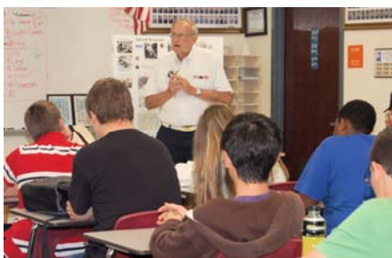
Tell America—Youth Education

Meet fourth Wednesday at 2:00 p.m. Leesburg Senior Center 1211 Penn Street (Behind Bob Evan's on US 27 at US 441)