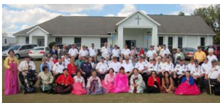
Korean-American family Apr 6, 2013

All veterans who served in Korea at any time from 1945 to the present, as well as those serving anywhere 1950-55, are welcome to our Chapter. We especially need those who served after the war to help us carry on. Please come to a meeting, contact one of those listed below, or go to our website for more information on membership.